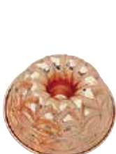
8260 Brioche Mold ø 18