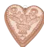
8337 Heart (cm 17x15)