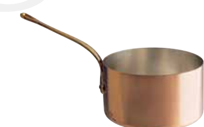
2104 Saucepan 2104-16 ø 16 2104-18 ø 18 2104-20 ø 20