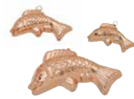
8414 Fish-Set of 3 (cm 11,5-15-23)