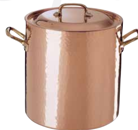
1102 Stockpot 1102-22 ø 22

These pieces are manufactured in 1,5 to 2,0 mm. thick solid copper, hammered and tinned over the fire by hand. For use on any heating element (except on induction hob).