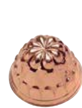
8225 Pudding Mold ø 17