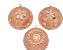
8205 Round Mold-Set of 3 ø 11