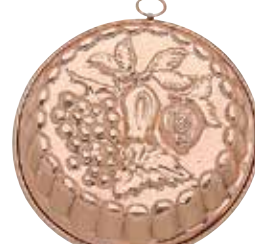
8287 Cake Mold Grapes ø 28