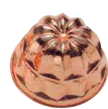
8226 Pudding Mold ø 22