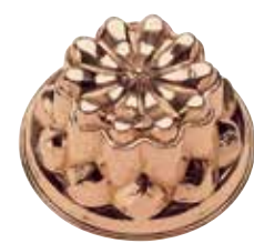
8227 Pudding Mold ø 23,5