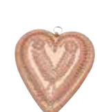
8335 Heart (cm 14,5x12)