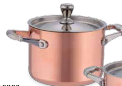
XSC10280 Minipot ø 10 with lid