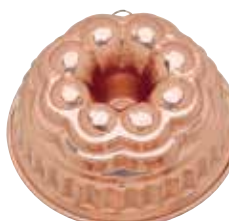
8268 Brioche Mold ø 26