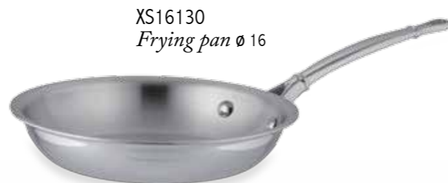
XS16130 Frying pan ø 16