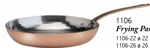
1106 Frying Pan 1106-22 ø 22 1106-26 ø 26