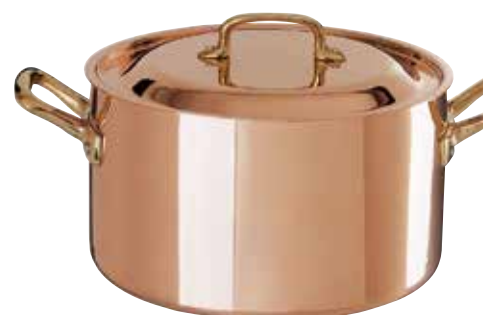
2103 Stewpan 2103-16 ø 16 2103-20 ø 20 2103-22 ø 22 2103-26 ø 26