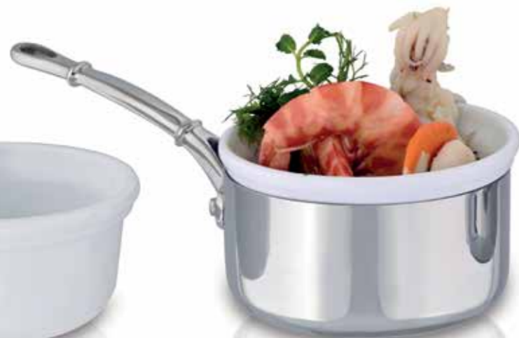
XSP0010 China insert suitable for XS and XSC range of ø 10