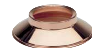
5151 Zabaglione Bowl Stand