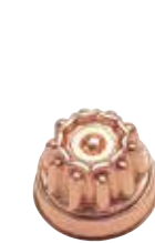
8223 Pudding Mold ø 13