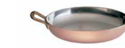
2105 Paella Dish 2105-22 ø 22 2105-26 ø 26 2105-30 ø 30 2105-36 ø 36