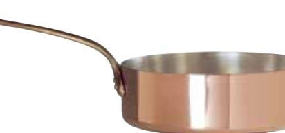
2114 Saute-Pan 2114-22 ø 22