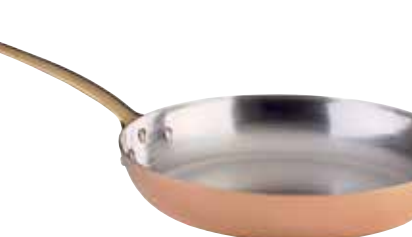
2106 Frying Pan 2106-22 ø 22 2106-26 ø 26 2106-30 ø 30 2106-36 ø 36