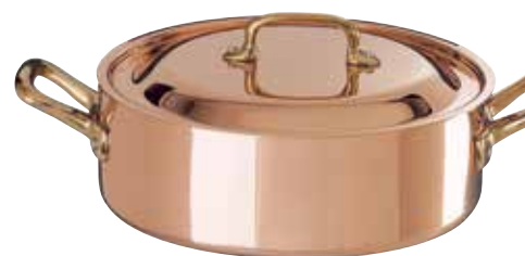
2113 Risotto Casserole 2113-22 ø 22 2113-26 ø 26