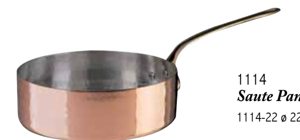
1114 Saute Pan 1114-22 ø 22