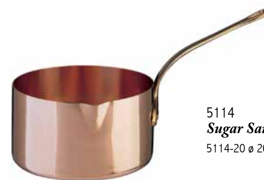
5114 Sugar Saucepan 5114-20 ø 20