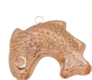
8412 Curved Fish (cm 20)