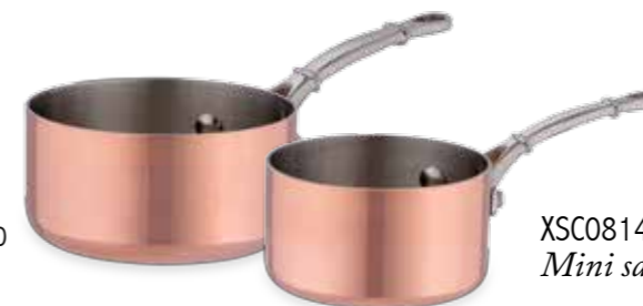
XSC08145 Mini saucepan ø 8