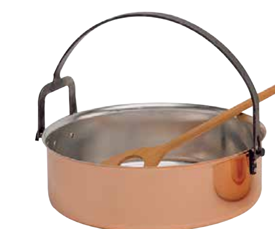
6220 Risotto Dish with Curved Handle 6220-26 ø 26 6220-30 ø 30