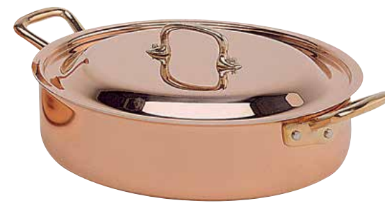
2113 Risotto Dish with 2 Handles 2113-26 ø 26 2113-30 ø 30