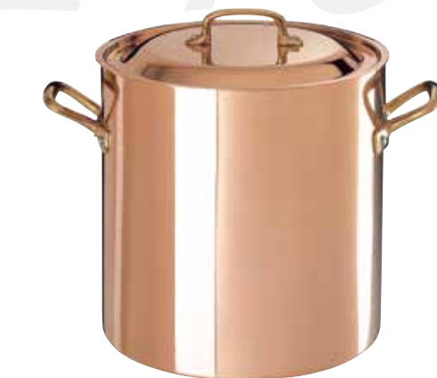
2102 Stockpot 2102-22 ø 22

Solid copper, thickness from 1,5 to 2,5 mm., the interiors are tinned over the fire by hand. Handles in highly polished solid brass, assembled with wide rivets. For use on any heating element (except on induction hob).