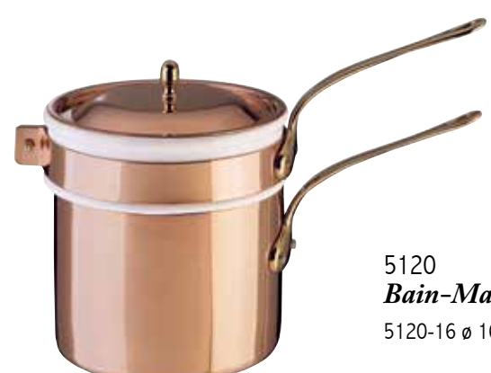
5120 Bain-Marie 5120-16 ø 16