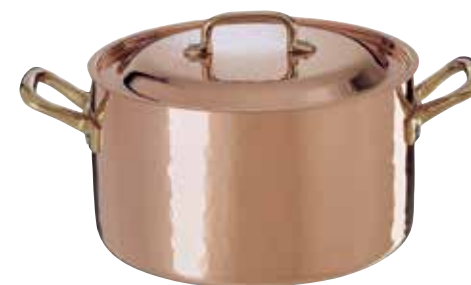
1103 Stewpan 1103-22 ø 22