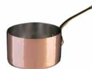
1104 Saucepan 1104-16 ø 16 1104-18 ø 18