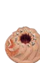
8257 Brioche Mold ø 16