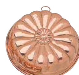
8281 Cake Mold Daisy ø 28