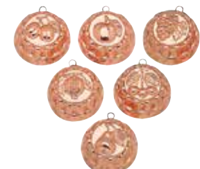
8206 Round Mold-Fruit Set of 6 ø 11

Our molds are made of solid copper, tinned over the fire by hand and given the finishing touches with skillful blows of the hammer. Thanks to meticulous researches into shapes and dimensions, they will enable you to make chocolates, flans, jelly, soufflés, puddings, cakes, iced desserts... Their beautiful shapes and decorations suggest their collection.