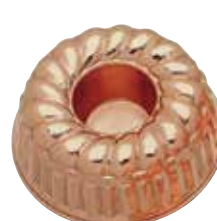
8264 Cake Mold ø 24