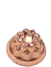
8224 Pudding Mold ø 14,5