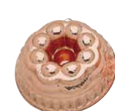
8263 Brioche Mold ø 23