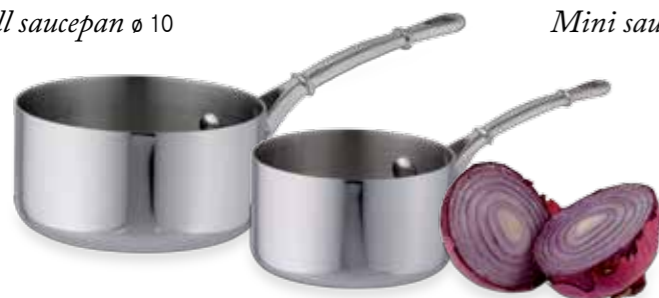
XS08145 Mini saucepan ø 8