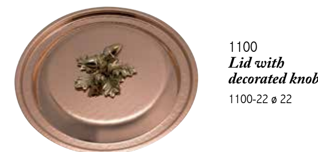
1100 Lid with decorated knob 1100-22 ø 22