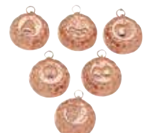
8109 Round Mold-Fruit Set of 6 ø 5