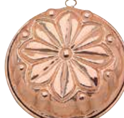
8282 Cake Mold Flower ø 28