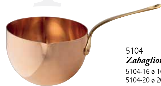
5104 Zabaglione Bowl 5104-16 ø 16 5104-20 ø 20

The perfect tools for any kind of food. Solid unlined 1,5 mm. thick copper tools for zabaglione, jelly, caramelized sugar, polenta... etc. and tin lined copper items for sauces, bain marie, risotto... etc. Handles in highly polished solid brass, assembled with wide rivets.