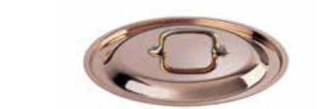
2101 Lid 2101-16 ø 16 2101-18 ø 18 2101-20 ø 20 2101-22 ø 22 2101-26 ø 26 2101-30 ø 30 2101-36 ø 36