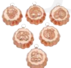
8202 Round Mold-Fruit Set of 6 ø 8