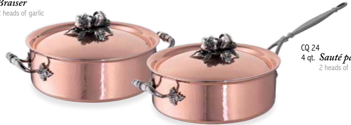
CQ 24 4 qt. Sauté pan 2 heads of garlic