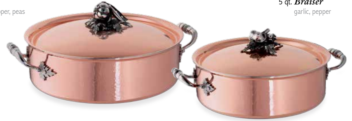
CH 26 5 qt. Braiser garlic, pepper