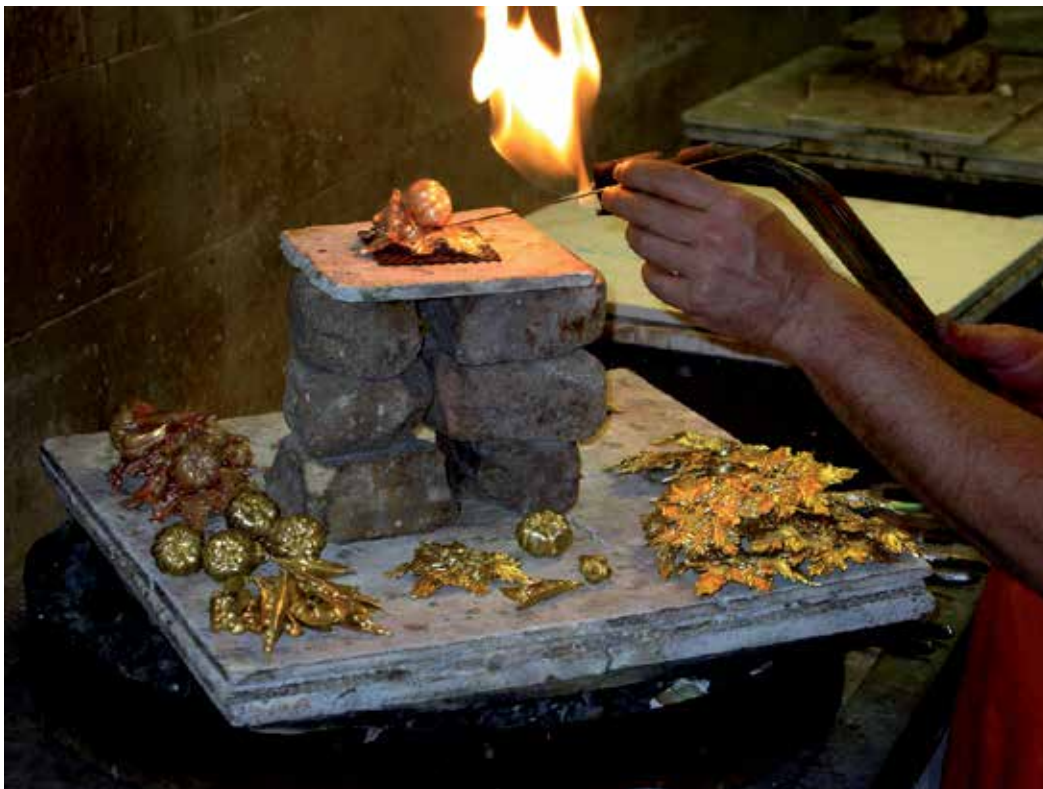
Soldering the composition of a knob that will then be polished and silver-plated.